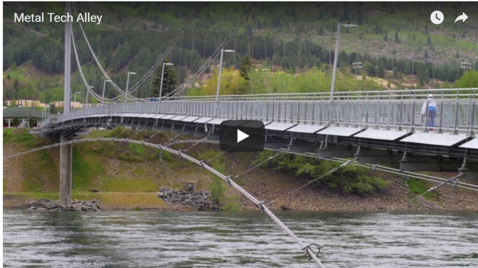
Metal Tech Alley Introduction